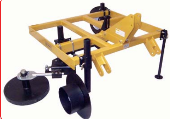
4' Fixed Frame w/one depth band couler, spin weeder and gauge wheel

The Spin Weeders were developed for vineyards, but can also be used for in-row weeding in narrow row orchards.