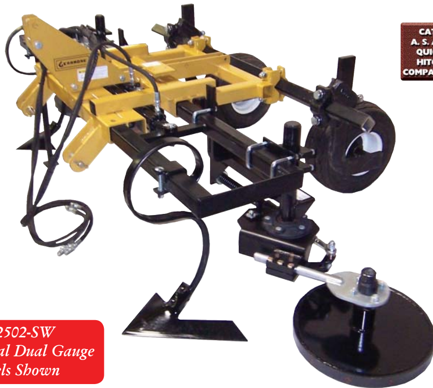
KW2502-SW w/Optional Dual Gauge Wheels Shown

The Spin Weeder is a "patent pending" berm tilling and in-row weeding system. The Spin Weeder digs into the row line, tills the soil and uproots the weeds. Also, the 18" half sweep aids the wheel to enter the ground and weeds up to an additional 9 inches. The Spin Weeders do not require a power source as they are self-powered by the forward speed of the tractor. The units can be mounted on fixed or hydraulic adjustable frames. Spin Weeders operate most effectively at 5 to 7 MPH. The weeders do not damage plant trunks because of three special features: