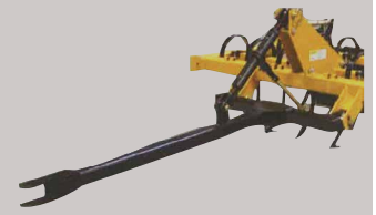
Pull hitch - option