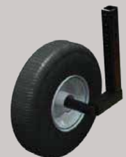
Gauge wheel - option