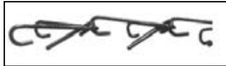
LIGHT ACTION Reversed tines angles farther back

Attach opposite end of chain harrow to drawbar. This will put the tines at about a 30 degree angle to the ground. You usually use this position when thatching pastures, incorporating seed, etc.