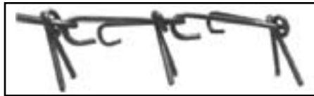
AGGRESSIVE ACTION Tines stand up at 75° angle

Attach to drawbar with the tines almost straight (perpendicular to the ground). You usually use this position when busting up clods, break-up and mixing in manure, preparing seed bed, etc.