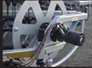
Equipped With Heavy-Duty High Torqued Motors