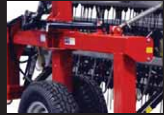
Faster Raising And Lowering Of Baskets