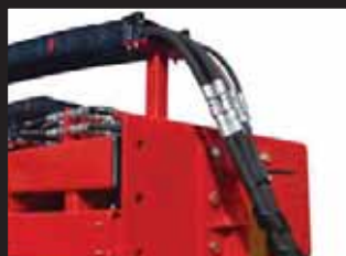
Split Hoses w/JIC Fittings For Serviceability