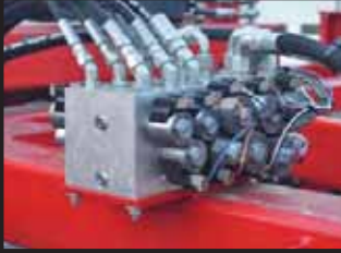
7-Function Electric Hydraulic Valve