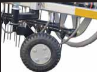
New Solid Rubber Gauge Wheel