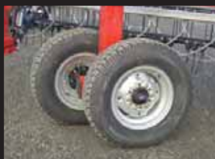
Offset Dual Wheels For More Stability