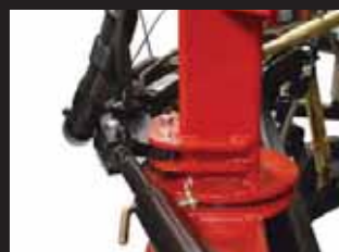
Double Shear Angle Cylinder Mount