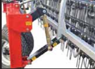
Basket Height Adjustment Link