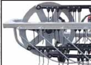
Baskets Equipped With Optional Full Tines

CLEANER HAY MEANS HIGHER RETURNS & MORE NUTRIENTS IN HAY & SILAGE!