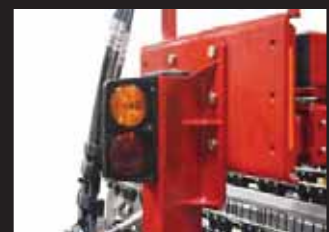
Transport Light Kit Per ASABE / ANSIS279