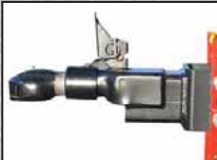
Optional 2 5/16" Ball Hitch