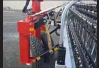
Parallel Linkage Torsion Basket Suspension