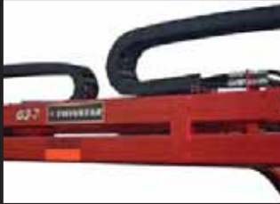
"Hose Trac" Hose Protection