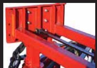
Double Extension Tubes For Added Strength