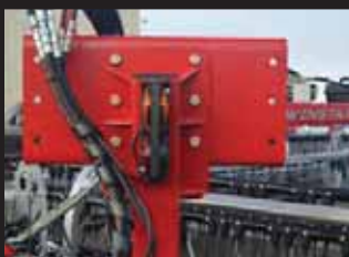
Slide Tubes w/3 Basket Positions for Offsetting Baskets

Field test conducted by a corporate farm in 2004 measuring the percentage of contaminants in raked hay using the following comparable width hay rakes: 5-Bar Basket Rakes, Rotary Rake, and Finger Wheel Rake. Results may vary due to equipment settings and field & crop conditions.