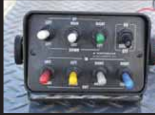
7-Function Control Box