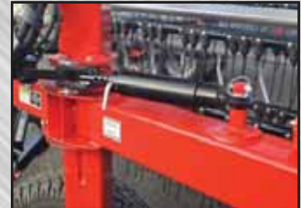
Optional Basket Angle Stop Kit