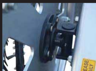
Self-Aligning Idler Hubs