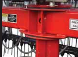
HD Basket Pivot w/UHMW Shims-Shear Bolt Protected