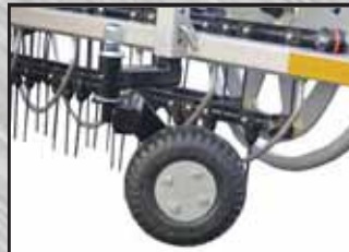
Frnt. & Rear Gauge Wheels w/Torsion Axle Suspension