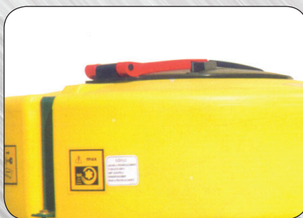
Hinged Vented Cover