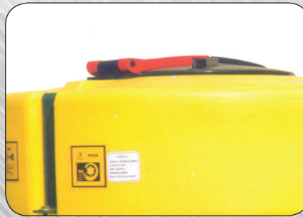
Hinged Vented Cover