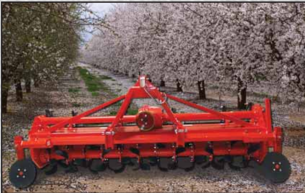
TILLER WITH OPTIONAL CUTTING DISCS

The all-in-one implement that tills, weeds, levels, incorporates pruning chips, reduces compaction, and lightly firms the soil. Tractors make many passes in the orchard throughout the year with even heavier equipment, which can cause deeper ruts and compaction. Our T Series Orchard Incorporators leave the soil in a smooth and level condition which improves appearance and helps prevent future floor damage.