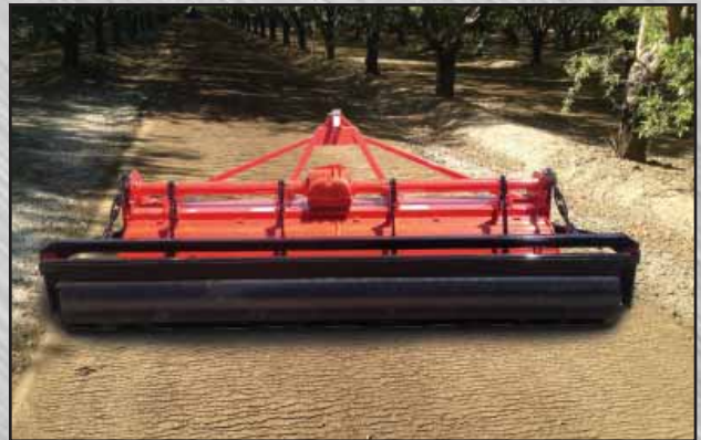
CLEAN, TILLED, AND ROLLED ORCHARD FLOOR