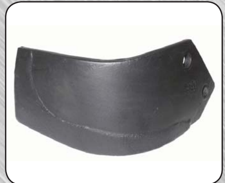
TUNGSTEN COATED TINES