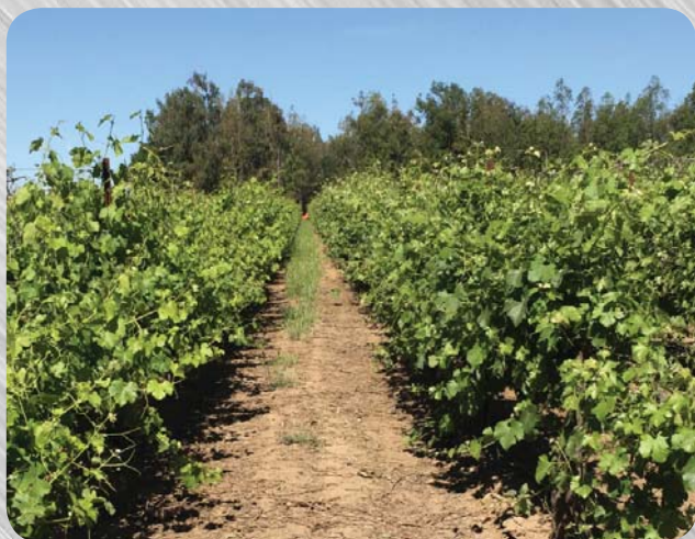
Uneven, compacted, weedy vineyard rows

Our incorporator tills, buries weeds and other organic material for decomposition. The incorporator then levels out the soil, rolls and lightly firms for appearance and additional traffic.