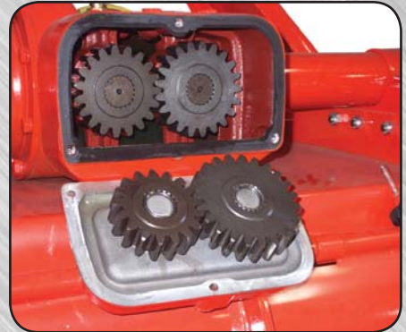
4 SPEED GEARBOX