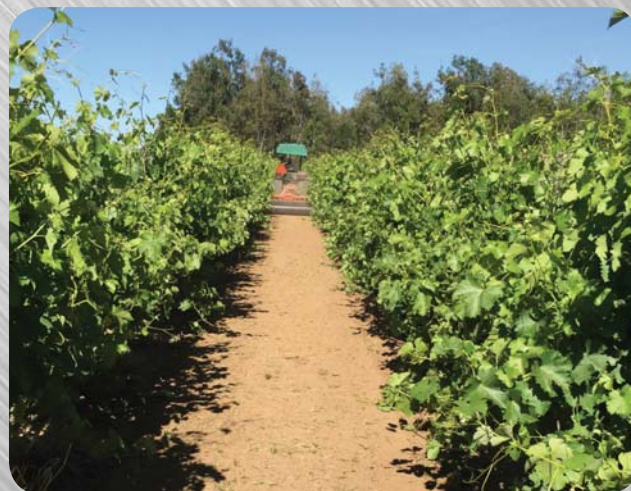
Tills, levels and rolls out the vineyard floor