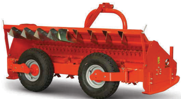
Optional Deflectors Shown

These units are excellent to achieve fine shredding of row crop residue, pastures and other types of farm usage.