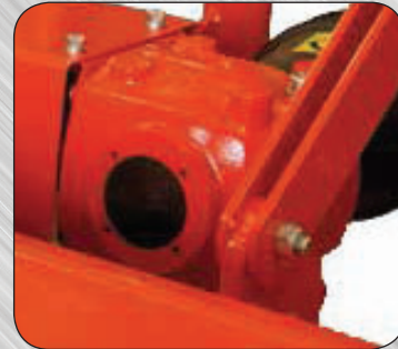
Heavy Duty 90 H.P. Gearbox