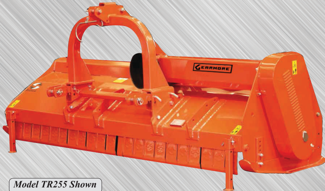
Model TR255 Shown

Our TR Series shredders feature a 90 horsepower gearbox, center mount with offsetable position, special lockable open tailboard with optional deflector brackets for spreading out shredded material, and adjustable foldaway gauge wheels.