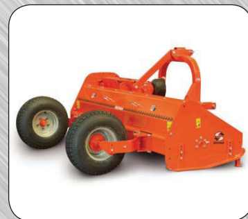
Gauge Wheels in Operating Position