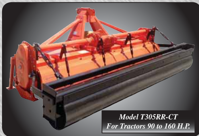
Model T305RR-CT For Tractors 90 to 160 H.P.