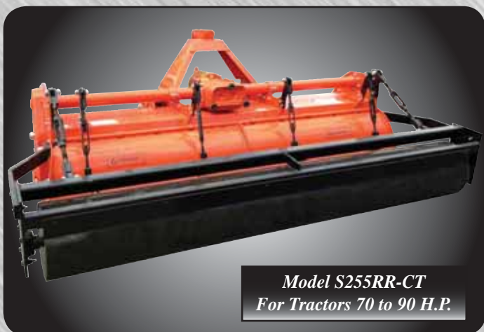
Model S255RR-CT For Tractors 70 to 90 H.P.