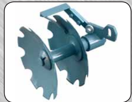
Back Fill Disc - is a non-retraction tool to rebuild berms at high speeds after the row line dries out