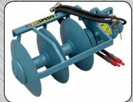
Power Disc - is the perfect tool to remove weeds and soil from the row line