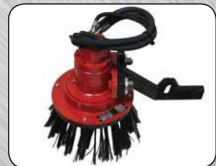
Rotary Berm Hoe with wire brush