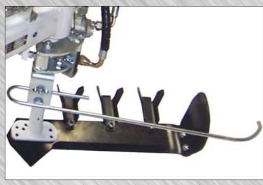
Blade with optional combs & plow