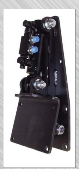
Optional hydraulic tilt kit*