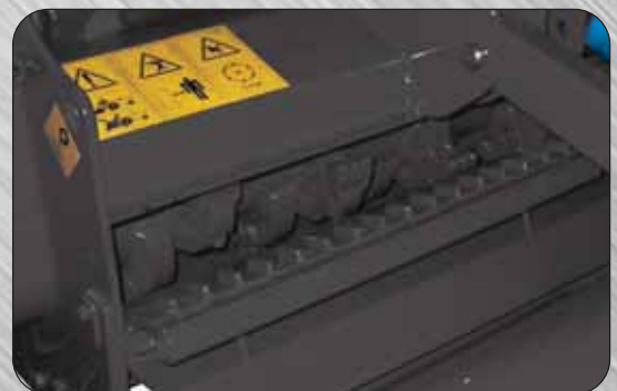
Two doors to access rotor and processing screen