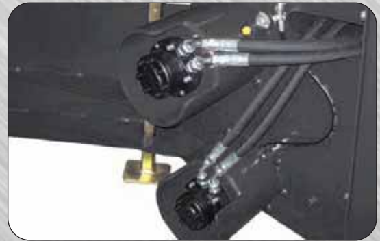
Two hydraulic motors power the feed rotors with protective casing