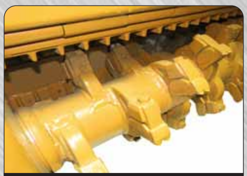
Wrap Around Rotor Blade Holder & Tungsten Carbide Tips

Note: These Mulchers are also available for Tractors 3-Point hitch mounted. PTO driven