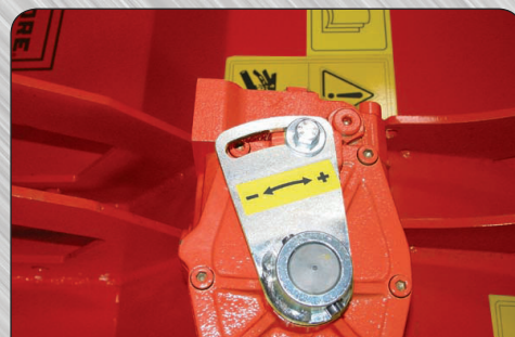
Piston Motor w/Adjustable Gallons Per Minute