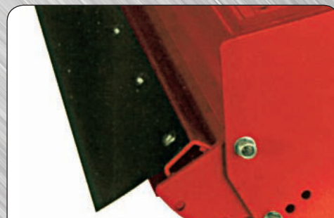
Adjustable Rear Deflector