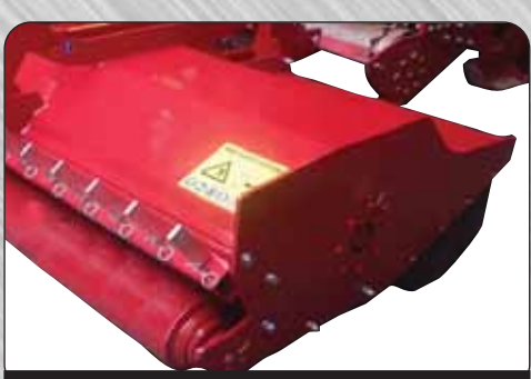
Multiple rear mounted rake teeth