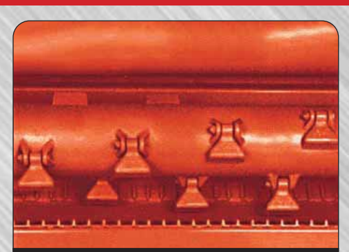
Rotorshaft, Knives and Cutter Bars