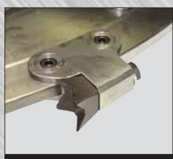
EDGE MOUNTED CARBIDE TEETH