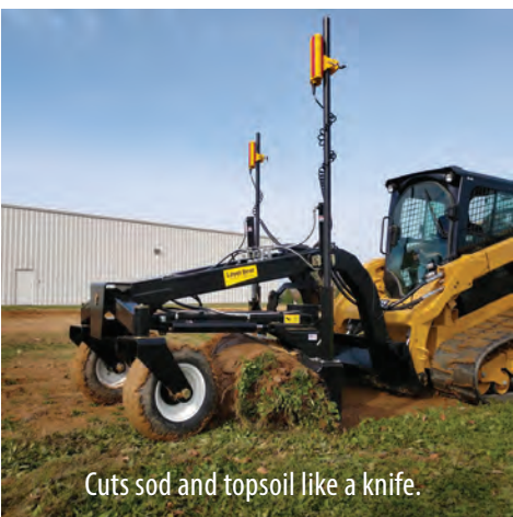
Cuts sod and topsoil like a knife.