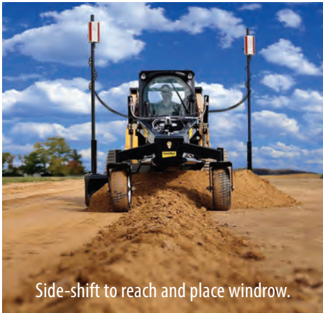
Side-shift to reach and place windrow.

Many prefer a grader blade over a box grader. Now you can work in windrows with the ability to adjust the working width of your precision grade. Smooth operation, and legendary Level Best performance.