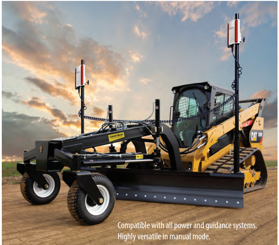
Compatible with all power and guidance systems. Highly versatile in manual mode.

Shown equipped with available Level Best EarthWorks Go guidance system