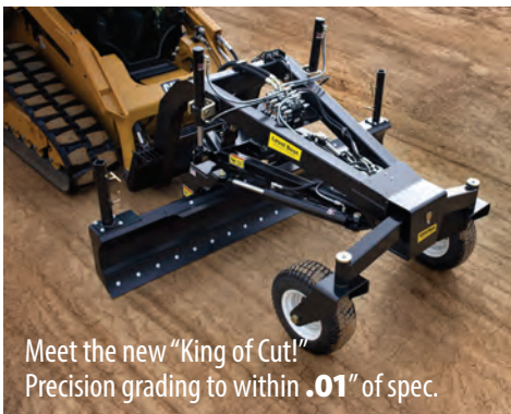
Meet the new "King of Cut!" Precision grading to within .01" of spec.