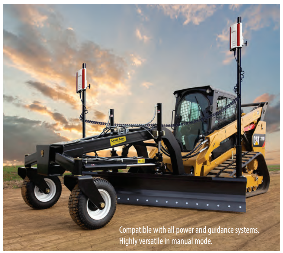
Shown equipped with available Level Best EarthWorks Go guidance system