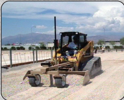
Caterpillar track loader and Para-Level grading scraper at work.

These Scrapers are usually sold with the optional laser grading system, as it allows the scrapers to finish grade elevations to within 1/4 inch. The top of the line Para Level Scraper is the smoothest operating system, as the grading box adjusts independently from the skid steer and the floatation wheels. The double box on the Para-Level also allows grading in forward and reverse. These high strength scrapers are designed to give years of trouble free use.