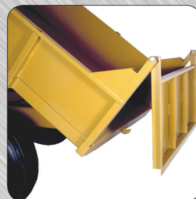
Large Hinged Tailgate