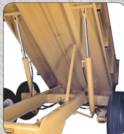
Dual Hydraulic Cylinders and Safety Lock Bracket