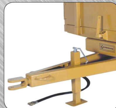
Swivel Hitch and Foldaway Tongue Stand

Specifications Subject To Change Without Notice