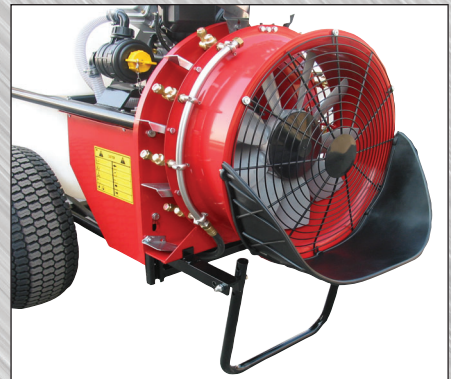
Trash Shield and Parking Stand