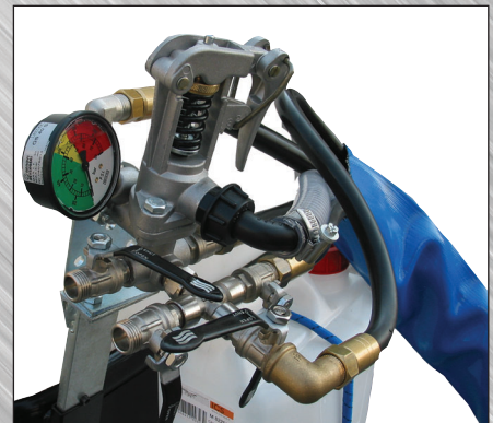
Pressure Regulator & Dual Handgun Outlets