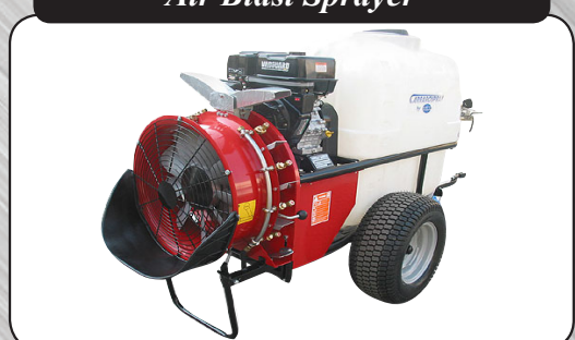
Air Blast Sprayer

The compact, self contained, engine driven air blast sprayers was designed for very narrow hemp rows and muddy conditions. This allows for operating the sprayer with an ATV tractors. The spray nozzles are easy to adjust and can be individually shut off. Controls allow for turning off one side. You can shut off the spray and disengage the fan for handgung spraying.