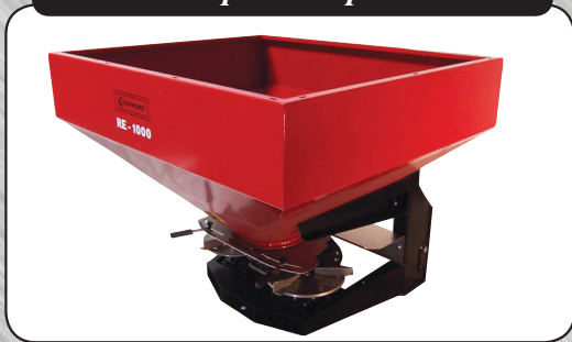
Twin Spinner Spreader

Our 2300 pound, 35 cubic foot capacity spreader features twin stainless steel spinner discs which are extremely accurate with only 6.7% variance across the spread pattern. The spreader has dual levers to set the pounds per acre and hydraulic cylinder for off and on. This broadcast fertilizer spreader has a maximum spread of 58 feet. It is best to apply the material before bedding up to rows. Model number is RE-1000.