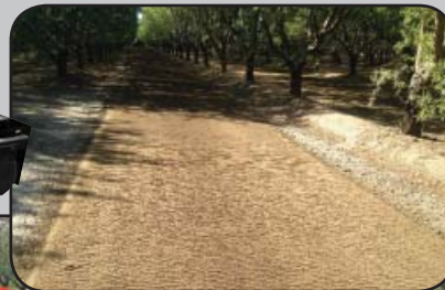
Cleaned, tilled and rolled orchard floor