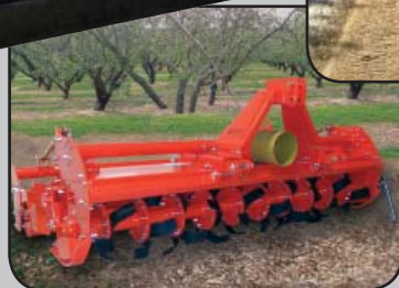
S Tiller with adjustable rear roller