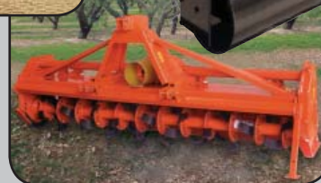
T Tiller with adjustable rear roller