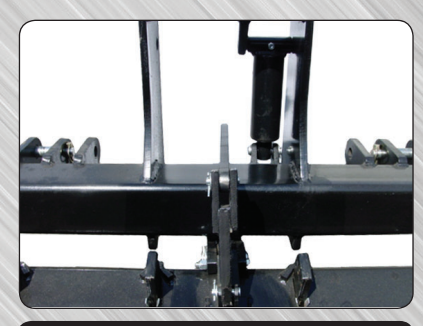
New cylinder and heavy, long lasting linkage brackets