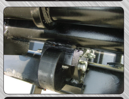
New solid steel hook and block assembly