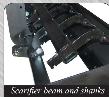
Scarifier beam and shanks