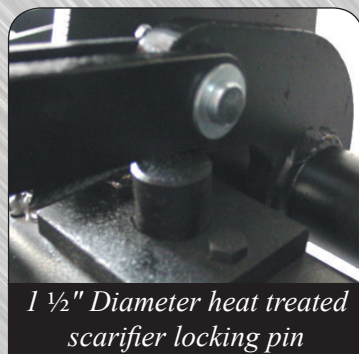
1 ½" Diameter heat treated scarifier locking pin