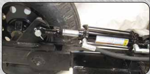
Hydraulic tilt with hoses

The "HC" High Capacity Series of Drag Scrapers feature heavy, large side plates - 1/2" thick. These side plates are 30" high by 40" deep, thus allowing for dragging and depositing large amounts of material. Like the "AP" series, the beam tongue extends to the rear moldboard and is held in place by a 5" x 5" heavy gusseted tube. The axle assembly is built with 4" x 2" tubing. The larger dairies and feedlots find these scrapers best for their operations. Now featuring larger tires and fold away tongue jack as standard equipment.