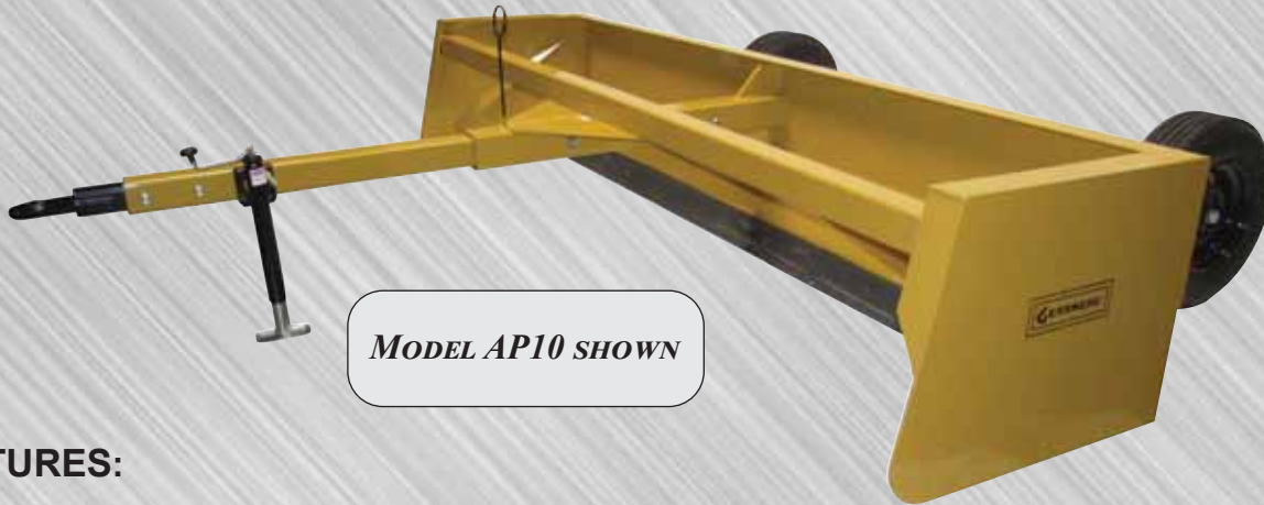
MODEL AP10 SHOWN