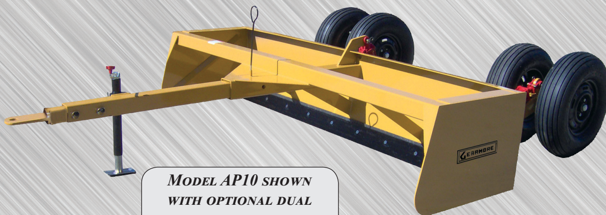
MODEL AP10 SHOWN WITH OPTIONAL DUAL WHEELS & TILT