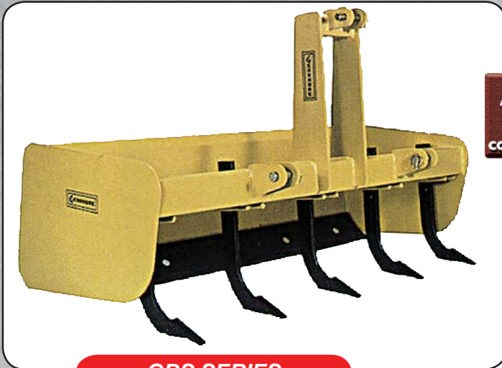
GBS SERIES MANUAL SHANK Pull Pin To Adjust

Available in Manual, Mechanical, or Hydraulic Shank Adjustments