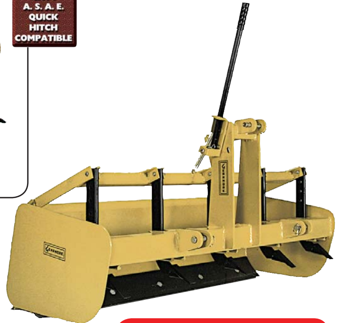
GBS/R SERIES RETRACTABLE SHANK Pull Handle To Adjust

CAT I A. S. A. E. QUICK HITCH COMPATIBLE