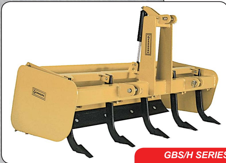
GBS/H SERIES HYDRAULIC SHANK Pull Valve Handle To Adjust

This unique line of Box Scrapers are available in 3 different shank adjustments. The scraper box is all welded construction for added strength.