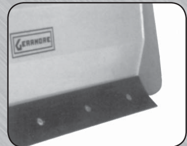
Side Plates Extended To Contain Soil When Back-Filling