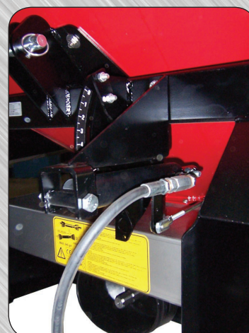
Hydraulic Cylinder For Off & On