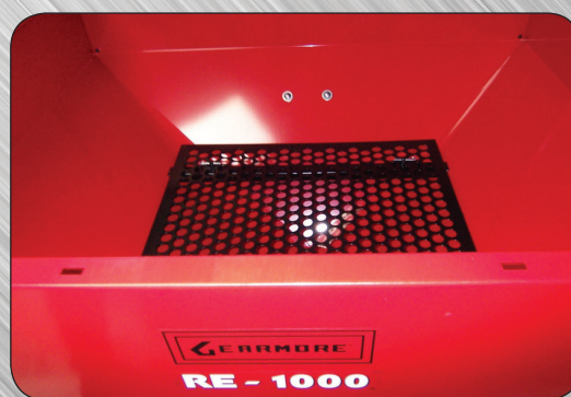
Screen To Stop Large Fertilizer Clods