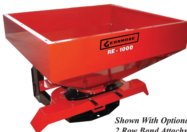
Shown With Optional 2 Row Band Attachment

Our 2300 pound, 35 cubic foot capacity spreader features twin stainless steel spinner discs which are extremely accurate with only 6.7% variance across the spread pattern. The spreader has dual levers to set the pounds per acre and hydraulic cylinder for off and on. The lever allows for easily setting the spreader for 180°, 90° right or 90° left hand spread. An important option is the two row band spread attachment for spreading material down row lines.