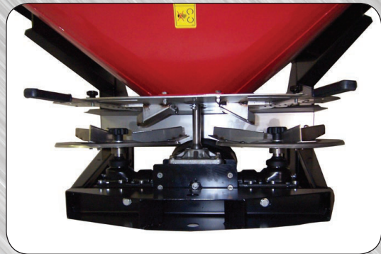
Twin Spinners and Gearboxes