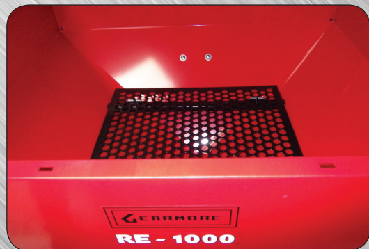
Screen To Stop Large Fertilizer Clods