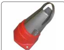
304.103 Spout Vineyard Spreading 6 to 13 Feet