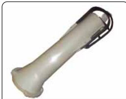
304.101 Spout Full Field Spreading 13 to 26 Feet