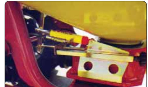
Optional hydraulic cylinder controls