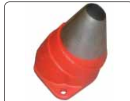
304.102 Spout Narrow Spreading 3 to 14 Feet