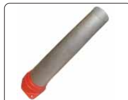
304.105 Spout Vineyard/Orchard 6 to 33 Feet