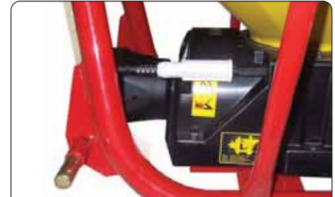
Easy to adjust lbs/acre by simply turning the dial.