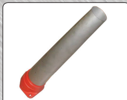
304.105 Spout Vineyard/Orchard 6 to 33 Feet