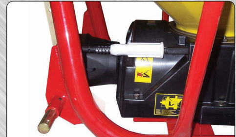
Easy to adjust lbs/acre by simply turning the dial.