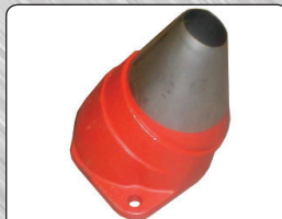
304.102 Spout Narrow Spreading 3 to 14 Feet