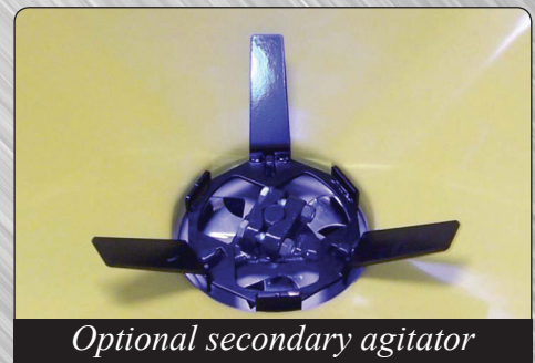
Optional secondary agitator