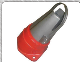
304.103 Spout Vineyard Spreading 6 to 13 Feet