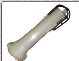
304.101 Spout Full Field Spreading 13 to 26 Feet