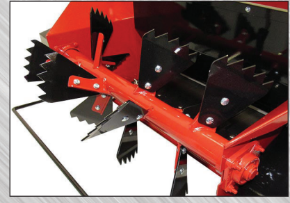
Replaceable Beater Paddles With Rooster Comb Design