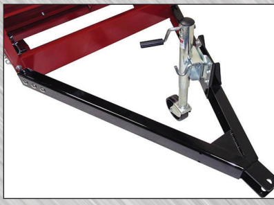
Dolly Wheel Jacks Standard on C-25GD and C-50GD