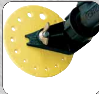
Rotating yellow calibration discs, adjusts easily to provide accurate and constant regulation of application