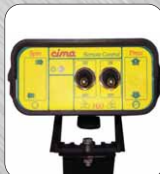
Electro valve controls to operate on, off, left, and right spraying