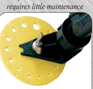
Rotating yellow calibration discs, adjusts easily to provide accurate and constant regulation of application