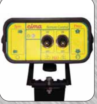
Electro valve controls to operate on, off, left, and right spraying