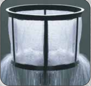
Shower head is built into the main strainer basket to easily put wettable powders into suspension