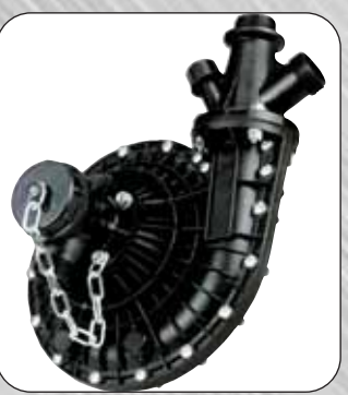
Low pressure centrifugal pump made of anti-corrosive materials requires little maintenance