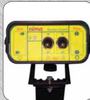
Electro valve controls to operate on, off, left, and right spraying