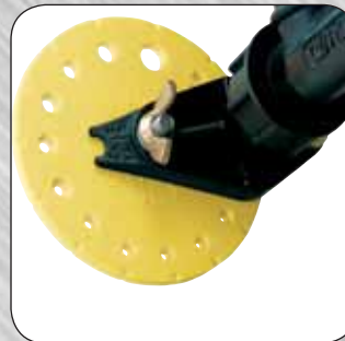
Rotating yellow calibration discs, adjusts easily to provide accurate and constant regulation of application