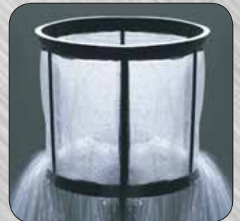
Shower head is built into the main strainer basket to easily put wettable powders into suspension