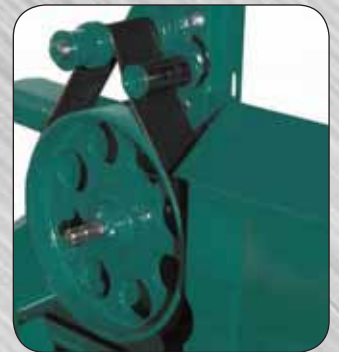
Power band fan speed up system with built-in overrunning clutch