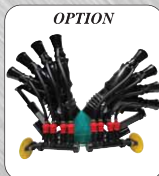
OPTION Electro cylinders with control box operated from tractor seat (inner spray heads)