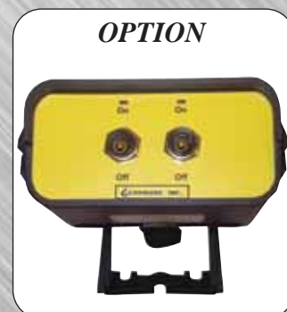
OPTION Electro valve controls to operate on, off, left, and right spraying