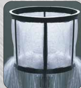
Shower head is built into the main strainer basket to easily put wettable powders into suspension