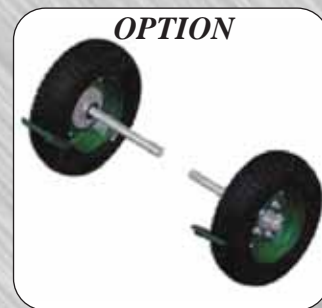
OPTION Bolt-on assist wheels are re-quired when sprayer is mounted on a crawler tractor