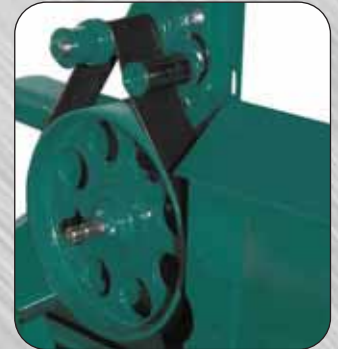
Power band fan speed up system with built-in overrunning clutch