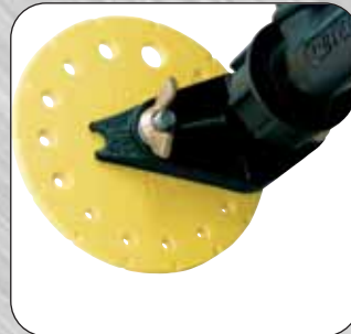
Rotating yellow calibration discs, adjusts easily to provide accurate and constant regulation of application