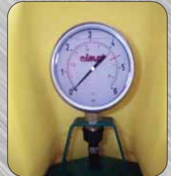
Large 3" dia. glycerine filled gauge, easy to see from tractor seat

Specifications Subject To Change Without Notice