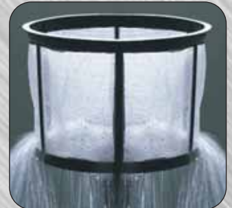
Shower head is built into the main strainer basket to easily put wettable powders into suspension