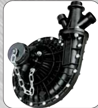
Low pressure centrifugal pump made of anti-corrosive materials requires little maintenance