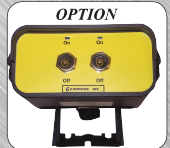
OPTION Electro valve controls to operate on, off, left, and right spraying