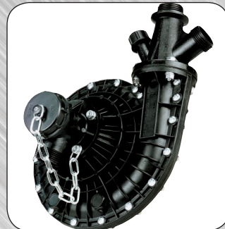
Low pressure centrifugal pump made of anti-corrosive materials requires little maintenance