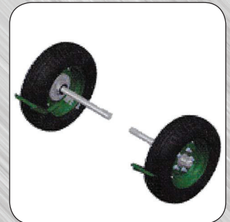
Bolt-on assist wheels are required when sprayer is mounted on a crawler tractor