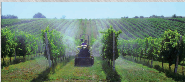
Many different distribution spray heads are available

These unique Venturi Air Sprayers feature the latest technology in concentrate spraying. Thus, growers achieve the following benefits: spray atomization of droplets are smaller and more uniform, less fill-ups, even distribution of concentrated spray, complete foliage coverage, better product utilization, less chemical waste and soil/water contamination. All Venturi Air Sprayers shown on the following pages have these same advantages.