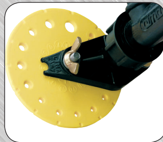
Rotating yellow calibration discs, adjusts easily to provide accurate and constant regulation of application