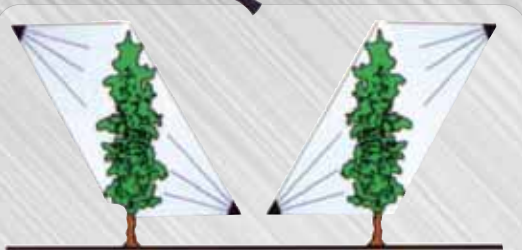
Shown with optional 2 row distribution head to spray 2 complete rows

The Gearmore T50S 2 Row Venturi Air Sprayer covers two complete rows at one time so your spraying time is cut in half; reducing your labor, fuel, wear and tear on your tractor/sprayer, and since you are traveling every other row you will have less soil compaction. Plant coverage is greatly increased because the spray enters the foliage from opposite directions at the same time. Thus, chemical drift is greatly reduced as the spray is held in the foliage longer.