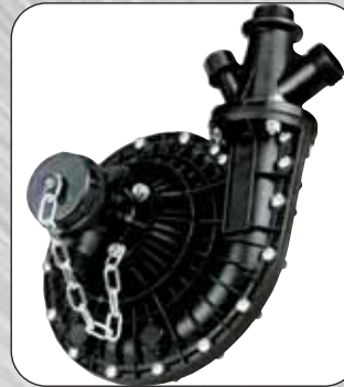
Low pressure centrifugal pump made of anti-corrosive materials requires little maintenance

Dimensions are less 2 row distribution spray head