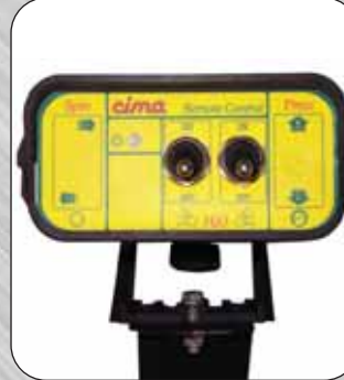
Electro valve controls to operate on, off, left, and right spraying