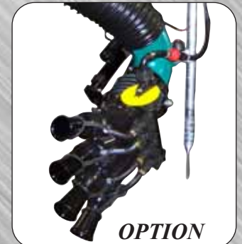
OPTION Electro cylinders with control box operated from tractor seat (outer spray heads)

Specifications Subject To Change Without Notice