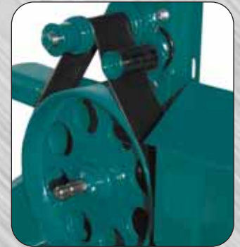
Power band fan speed up system with built-in overrunning clutch