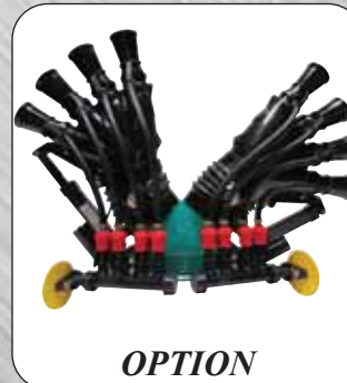
OPTION Electro cylinders with control box operated from tractor seat (inner spray heads)