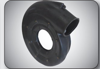
One piece polyethylene fan housing