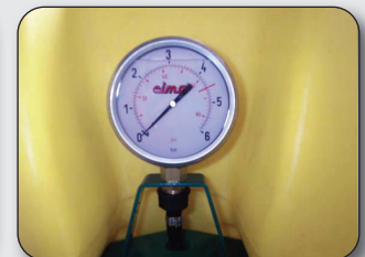
Large 3" dia. glycerine filled gauge, easy to see from tractor seat