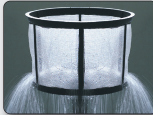
Shower head is built into strainer basket