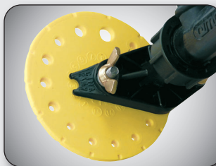
Rotating calibration discs - easy to adjust & regulate chemical application