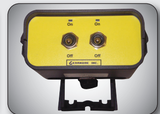
Electro valve controls to operate on, off, left, & right spraying