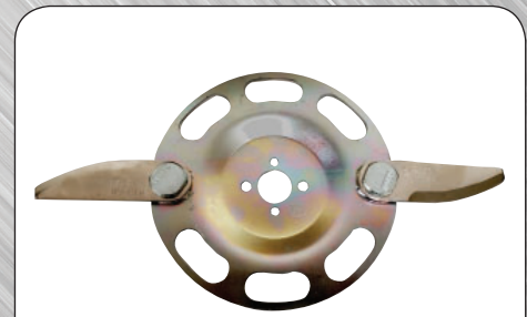
Optional swing knives for branches up to 1" in diameter