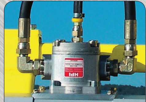
Hydraulic motor provides high powered transmission to blades