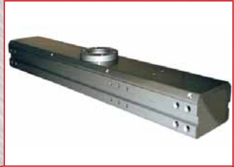
Saw blade housing module