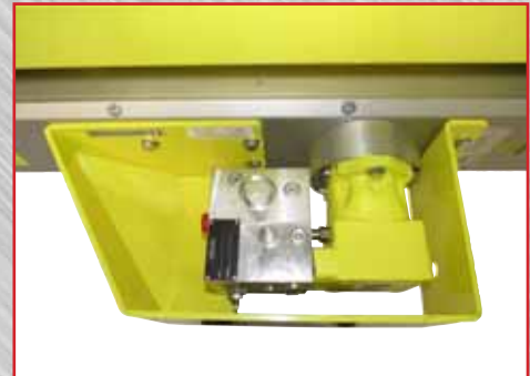
Hydraulic motor, block & protection guard