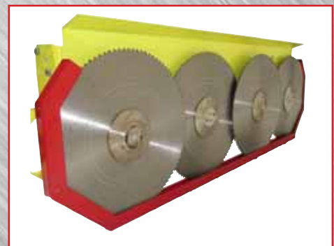
Safety guard when unit not in use