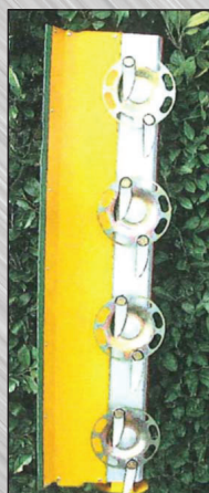
Optional Knife Head

The COLLARD Hedger/Topper was designed to hedge, top trees and bush crops. The vertical reach for hedging is 20 feet and flat topping of 13 feet. The machine is front tractor mounted. Easy to operate with electric controls. The cutting bar length is 6.8 feet and additional blades can be added for longer cuts. Also, the new larger capacity 15cc hydraulic motors increase the power by 20% for faster, clean cuts. This unit is great for orchard hedging, topping and fence line maintenance.