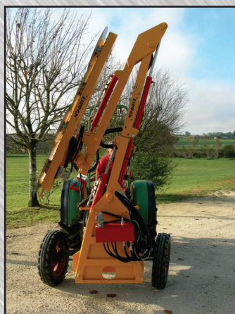
Hedger in Transport Position