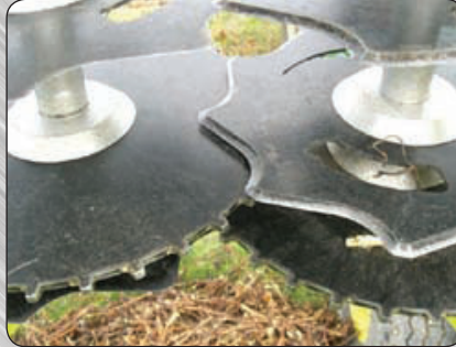
Cutting blades and notched discs for clean cuts and trellis post protection.