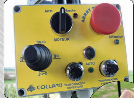
Control panel and hand switch for manual override optical cells (electric eyes) allows for automatic retraction on all types of posts