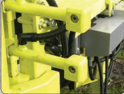
Optical cells that are for automatic opening and closing cutting heads