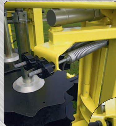
Trellis post protection, also includes hydraulic dampers