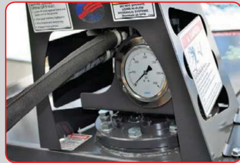
Optional Pressure Gauge Indicator