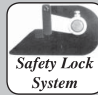
Safety Lock System

UNIV Series These bucket forks provide increased production and versatility on front end loaders. Turns your loader into a forklift in seconds. Special safety lock brackets are welded to the bucket to insure that the tines are locked in place. Tines are made of special boron steel and fully heat treated after bending, except the 12 UNIV . Rods are made of 4140 ground polished high carbon steel.