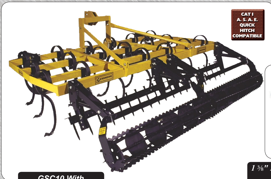
GSC10 With 7" Sweeps