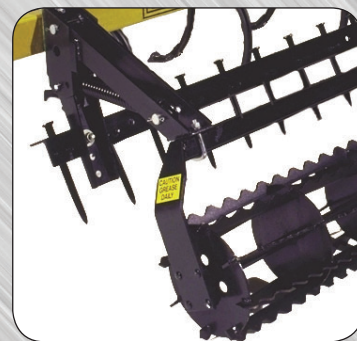
Spring Loaded Crumbler & Spike Bar