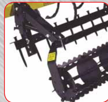
Spring Loaded Crumbler & Spike Bar