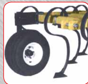
Gauge Wheels (Std. on 10' & Larger)